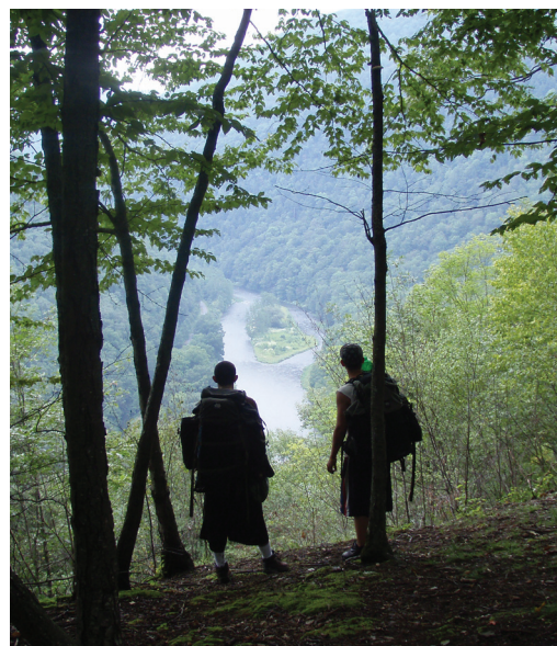
Flight Program participants enjoying a hike.

"I find it heartwarming and amazing," he says. "I really am paid with their love and respect. I get so much more than I could ever give."