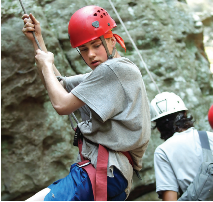
Wilderness Center youth rock climbing.

Two years after Diakon Youth Services debuted the Turning Point Evening Reporting Center, a second component, the Turning Point Day Program, has successfully reached the end of its first school year.