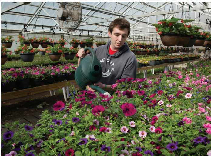
An intern watering flowers in the Wilderness Greenhouse.