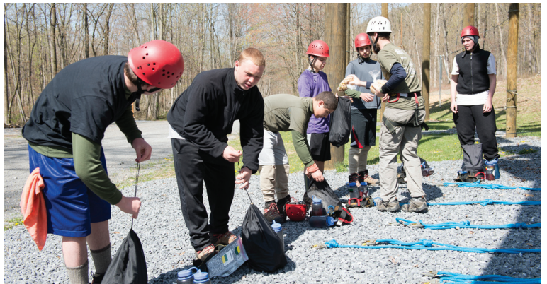
Text text text