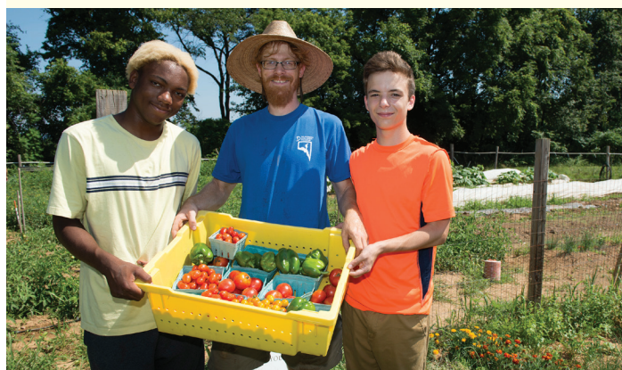
Produce from the vegetable garden at Cumberland Crossings

In addition to supporting the vegetable needs of the kitchens at Diakon's Frey Village, Middletown, Pa., and Cumberland Crossings, Carlisle, Pa., senior living communities, Edenbo is operating a weekly farmers market at both locations so that residents can purchase fresh vegetables.