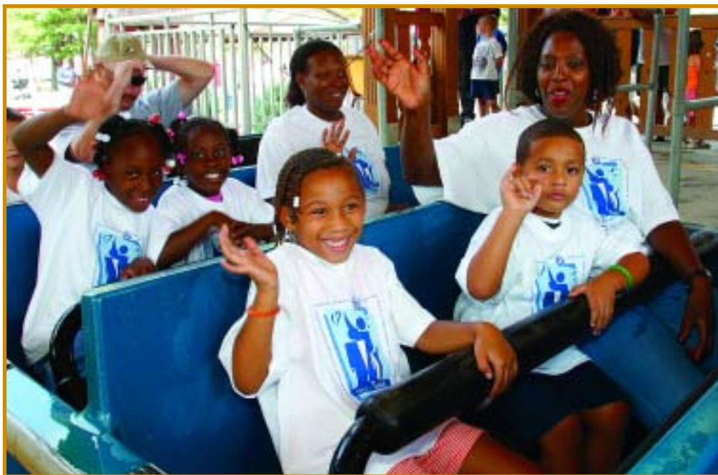
Adoptive families from Pennsylvania and Maryland were treated to a day in the park at Knoebel's Amusement Resort in Elysburg, Pa., as part of Diakon's celebration of 30 years of adoption services.