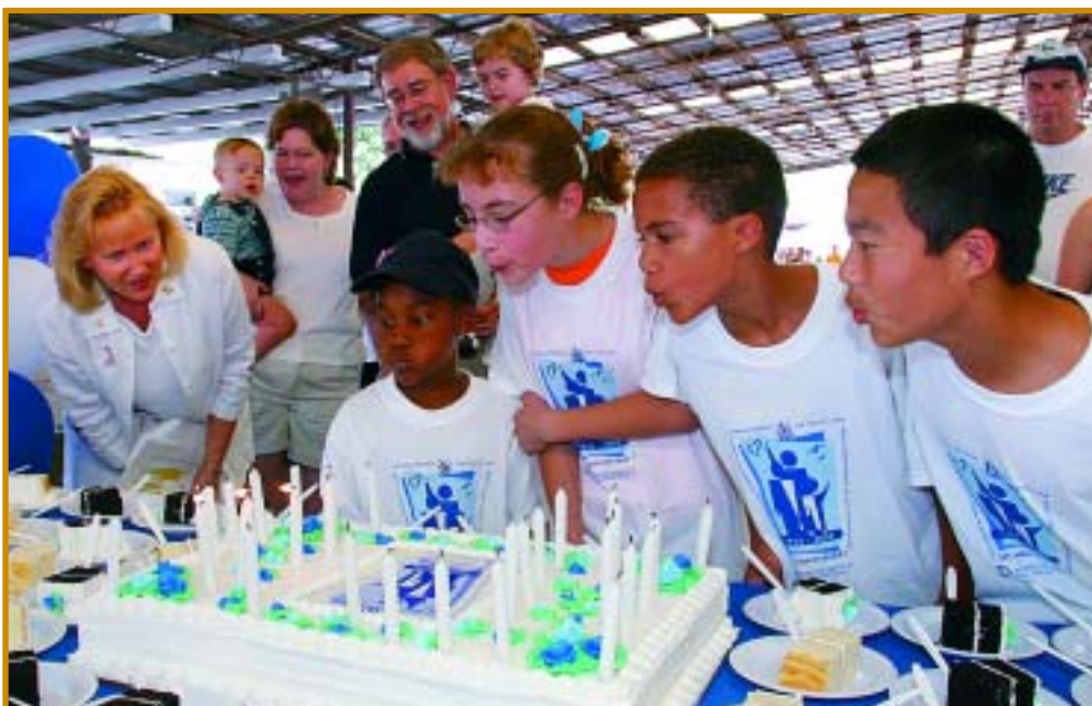
Adoptive children blow out 30 candles on a cake at Adoption Services' 30th anniversary celebration.