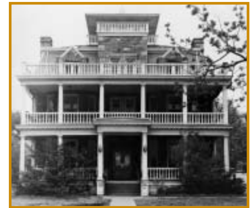
The Lutheran Home at Harrisburg

The Lutheran Home at Harrisburg was dedicated in April of 1952, serving 27 residents. Additional facilities were established on the West Shore in 1957 and in upper Dauphin County in 1961.